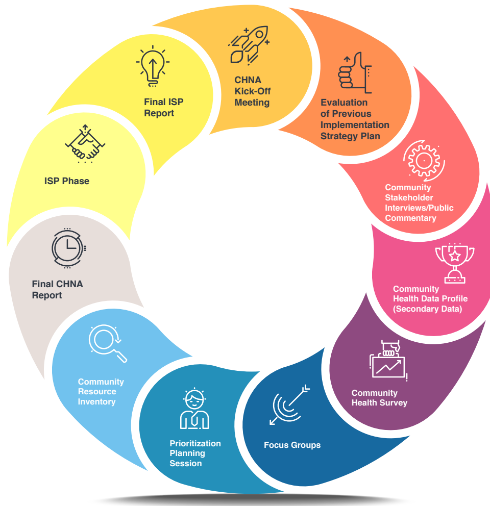
Figure 1: Process Chart of Community Health Needs Assessment 2022

In 2022, Beebe Healthcare joined together with Tripp Umbach to conduct a comprehensive community health needs assessment for the service area of Sussex County. The CHNA process included input from persons who represent the broad interests of the community served by the hospital, including those with special knowledge of public health issues and representatives of vulnerable populations. The overall CHNA involved multiple steps depicted in the flow chart below.